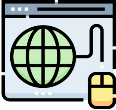
Harmful Online Content