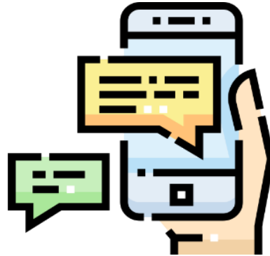
Distraction from Learning