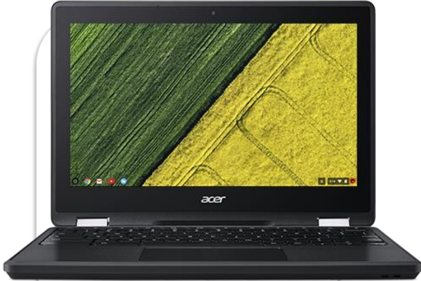
Acer Chromebook Spin R752TN-C1MT